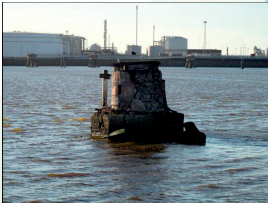
Plate 15-1 Dolphin Mooring Bollard located at the recorded position of the Seventh Buoy Light ( 63 )